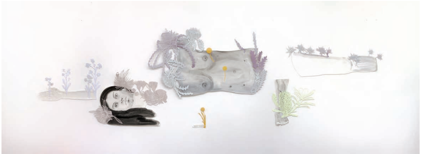
1/ Sangeeta Sandrasegar, And I see myself, flat, ridiculous a cut paper shadow , 2010, 170 x 130 x 3cm, varying papers, watercolour, glitter, sequins, adhesive pottu