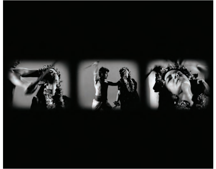
Pushpamala N., video stills from Indrajaala/Seduction , 2012, 3-channel video (silent, looped), 4.27min; from the body of work, Avega – The Passion: The Drama of Three Women , 2012; images courtesy the artist

chameleon style. ‘Surpanakha’ sways evocatively in circular motions. Her hypnotic gestures were inspired by an ethnographic film Pushpamala saw in Melbourne, an unusual Australian connection for a work based on one of the key Hindu texts, the Ramayana . The video deconstructs the original story in a present context that borrows from Western and Indian cinematic genre codes, the paintings of Ravi Varma, psychoanalysis and contemporary events.